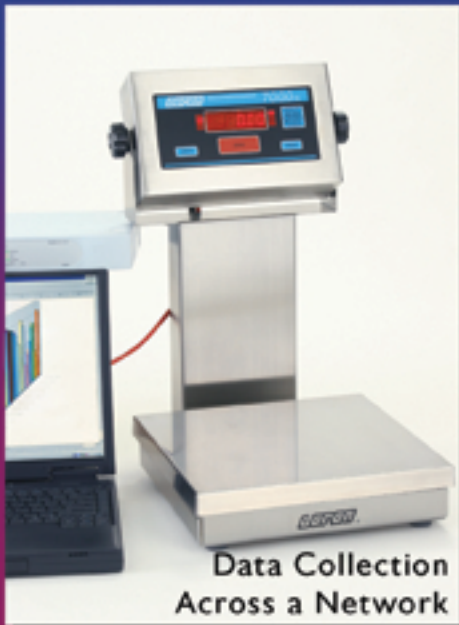
Data Collection Across a Network