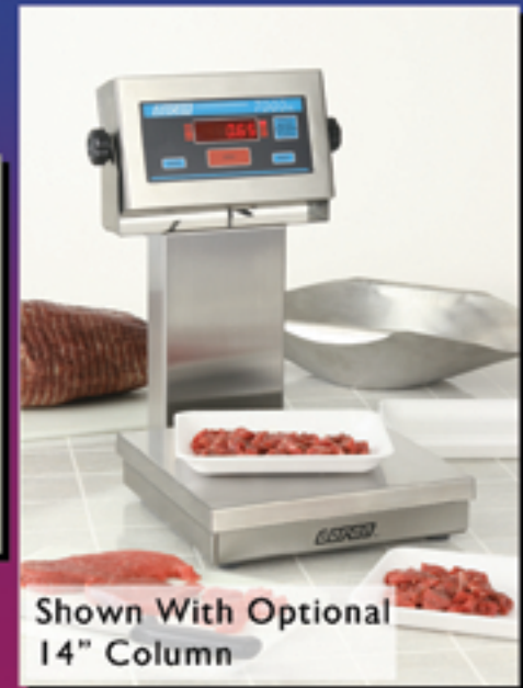
Shown With Optional 14" Column