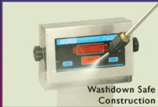
Washdown Safe Construction